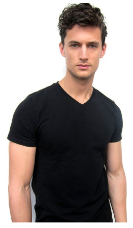
PHOTO 3: Against a white wall, full length body shot. Neat/casual clothing.

PHOTO 2: From the waist up. Serious face.